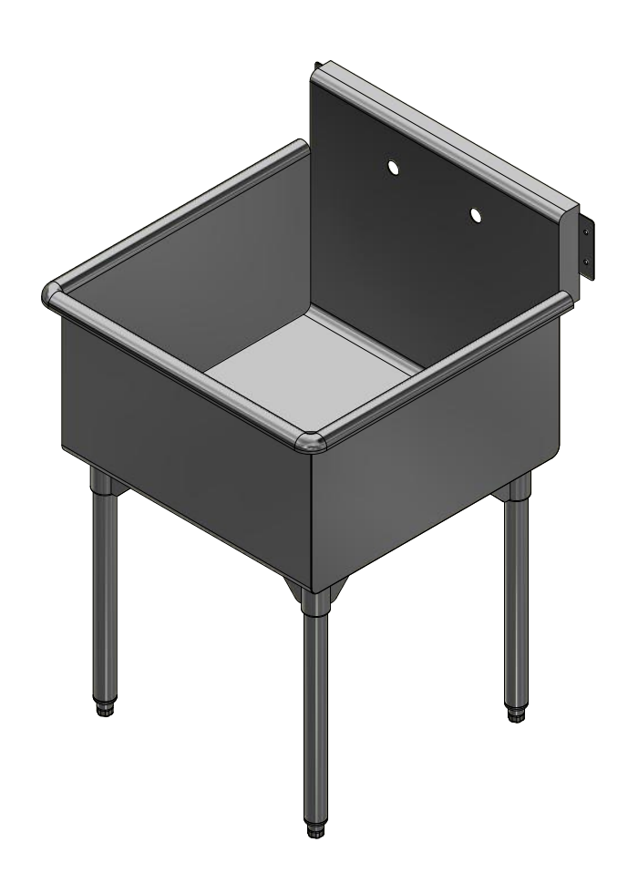
3D SCALE 1/12